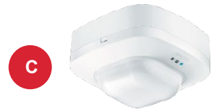
Multisensor "Slave" Optional for expanding the detection range 5LZ925601 + Mounting housing 5LZ925AP