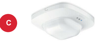
Multisensor "Slave" Optional for extending the detection range 5LZ925601