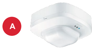
Multisensor "Master" 5LZ925602